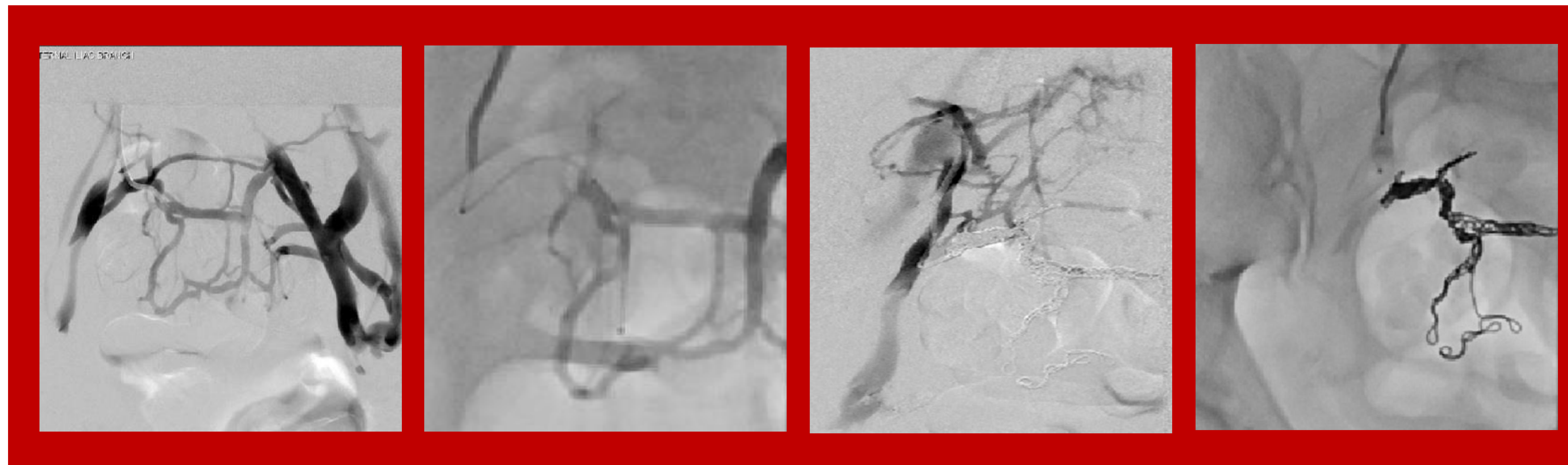
Figure 1 – Digital subtraction venography demonstrating right external iliac vein passive reflux and numerous pelvic varices. Figure 2 – Location of the pelvic varices confirmed with right internal iliac venogram. Figure 3 – Decreased flow within the varices on post coil embolization of the right internal iliac vein. Figure 4 – No flow in the varices post plug embolization of the proximal right internal iliac vein.

Pelvic ultrasound with figure 1 demonstrating a dilated vessel in the cervix. Figure 2 demonstrates slow flow within that dilated vessel.