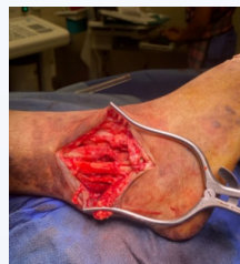
Figure 3: Intra-operative visualization of open fracture site wound was noted to track deep to ankle joint with soft tissue defects but intact peroneal tendons noted.

Next vessel loop assisted closure was performed with staple gun and vessel loops due to soft tissue deficit and trauma to underlying deep tissue. (Figure 6) Patient placed in well-padded dressing and posterior mold. Patient remained completely non-weightbearing right lower extremity.