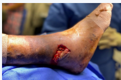
Figure 1: Pre-operative image with exposed peroneal tendons and tissue loss

Open fractures are associated with tissue loss and severe injuries to surrounding structures. As such, open fractures are often associated with wound healing complications due to difficulties in obtaining wound closure, infection, and necrosis of soft tissue. Full-thickness acute wounds treated with fish skin grafts heal have been found to heal significantly faster than wounds treated with dehydrated human amnio-chorionic membrane 1 . Acellular fish skin grafts contain omega-3 polyunsaturated fatty acids, which reduce inflammatory responses and advance cytokines to promote wound healing 2 ; a new form of these grafts is divided into tiny fragments (0.15 cm) that can mold into wound beds.