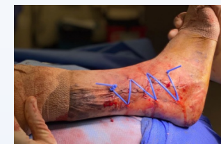
Figure 6: Vessel loop was utilized to assist with closure due to soft tissue deficit and trauma to underlying structures.