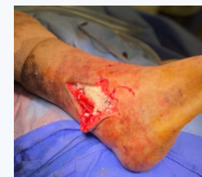
Figure 5: Mixed demineralized bone matrix and acellular fish skin graft packed into bony void and surrounding fibular plate.