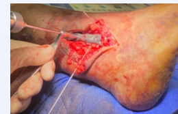
Figure 4: Application of contoured distal fibular plate with temporary k-wire fixation

Further double-blinded, randomized controlled trials are recommended to determine the clinical effectiveness and utility of the Kerecis Omega3 Wound graft for wound healing in the setting of open fractures.