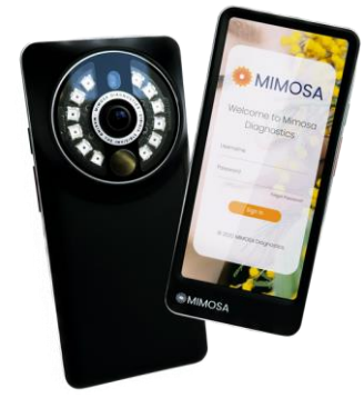
**MIMOSA Pro; MIMOSA Diagnostics, Inc., Toronto, ON.

Subjects with DFUs were enrolled into an IRB-approved observational study between March 2023 and August 2023. For this abstract, a case series design was employed that includes subjects with an existing diabetic foot wound. A hand-held multispectral NIRS imaging device** that utilizes near-infrared light to assess tissue oxygenation levels at multiple wavelengths was used. This device also measured skin surface temperature. Patient demographics, clinical characteristics, NIRS measurements, wound characteristics (WIFI classification), and healing outcomes were collected and analyzed.