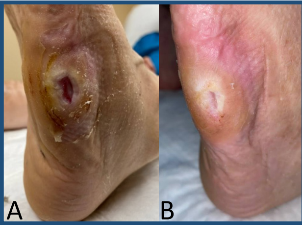
Case 2: A) Prior to graft prep with nylon hooked medical fabric B) 5 weeks post graft

References: Borg, et al. Trans Epithelial Endocervical and Exocervical Biopsy with Minimally Invasive Fabric Based Devices. J. Lower Gen Tract Dis/col. Sixteen, Number Two, April 2012 Supplement pg. 522 Winter, et al. Fabric-Based Exocervical and Endocervical Biopsy in Comparison with Punch Biopsy and Sharp Curettage. J. Lower Gen Tract Dis., Vol. Sixteen, Number Two, April 2012 pg. 40-47 Diedrich et al. Improvement in Endocervical Yield with Fabric Curettage. J. Lower Gen Tract Dis, April 2014 - Volume 18 - Supplement 1 S, p. 519. Clark et al. High Correlation of Fabric-based Cervical Biopsy to SubsequentLEEP. J. Lower Gen Tract Dis, April 2014 - Volume 18 - Supplement 1 S, p. 522. Clark et al. Observation of a Robust Immune Inflammatory Response Following Frictional Fabric Biopsy During Colposcopy. J. Lower Gen Tract Dis, April 2014 - Volume 18 - Supplement 1 S, p. 521. Yeh et al. Feasibility to Diagnose Cervical Cancer During Colposcopy Using Fabric-Based Minimally Invasive Biopsy Devices. J. Lower Gen Tract Dis, Volume 20, Number 2, Supplement 1, April 2016, p. 522. Yeh et al. Wound Care: A Comparison of Spiral Biopsy and Fabric-Based Minimally Invasive Exocervical Biopsies Relative to Punch Biopsy. J. Lower Gen Tract Dis, Volume 20, Number 2, Supplement 1, April 2016, p. 523.