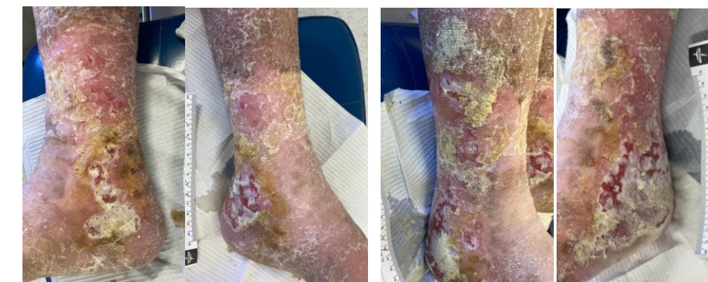
9/14/23 L medial: 5.0cm x 3.2cm x 0.1cm R medial: epithelialized L lateral: 3.5cm x 3.5cm x 0.1cm R lateral: 5.5cm x 2.2cm x 0.1cm