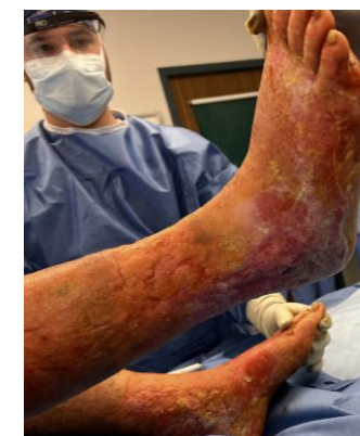
12/14/2022 4 th application

Accelerated healing trajectory 2 nd Application