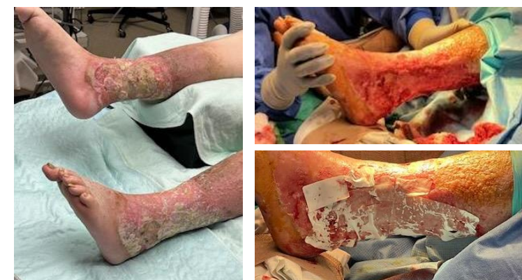
8/24/2022 RLE: 18.8cm x 27.7cm x 0.4cm LLE: 21.5cm x 27cm x 0.4cm

Accelerated healing trajectory 2 nd Application