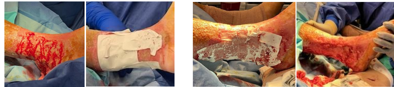
RLE RLE: 15cm x 26cm x 0.4cm