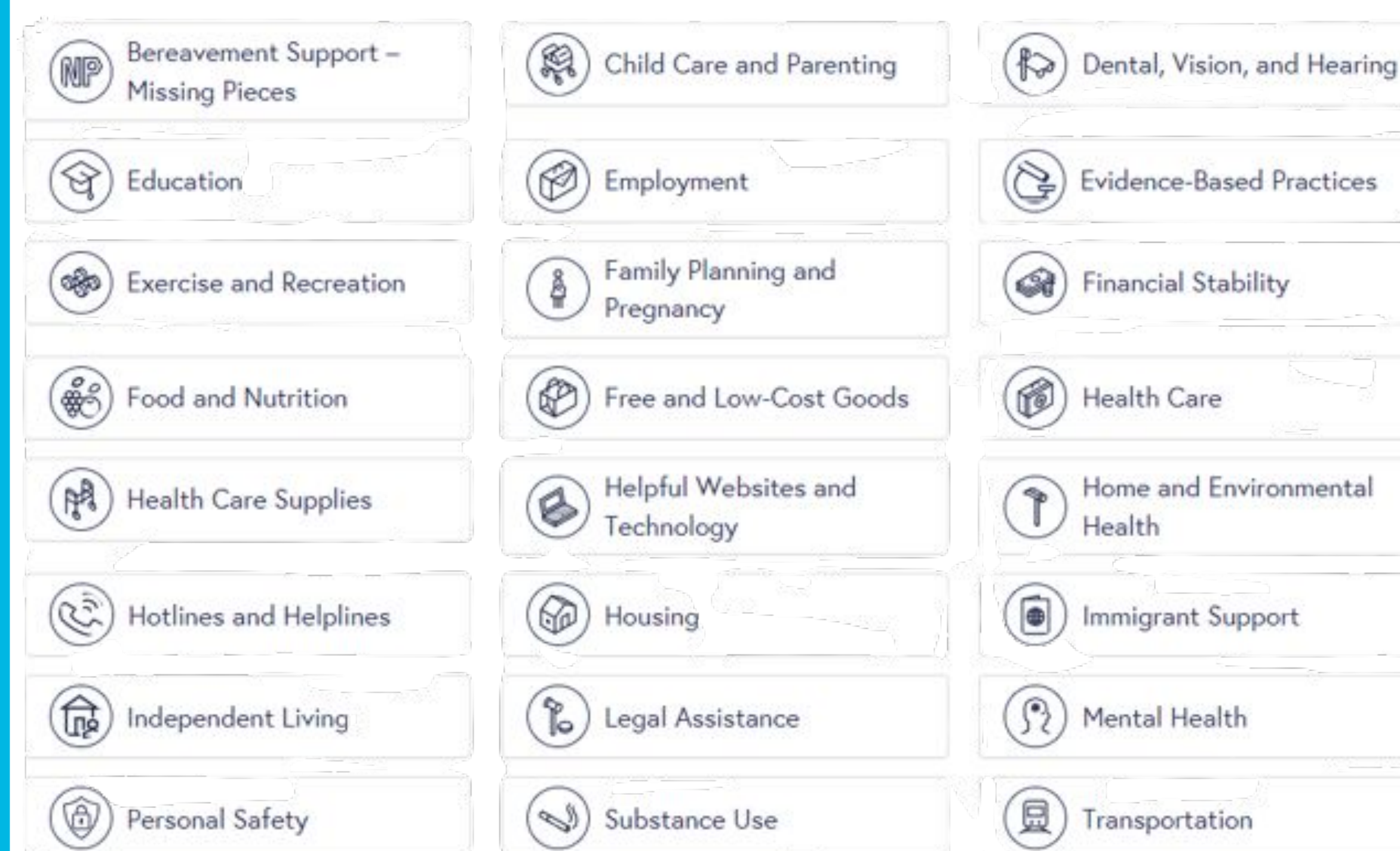
Figure 2: NowPow's PowRx Platform NowPow, a digital platform to provide personalized referrals to community resources that will help them continue to improve their health after they leave Hackensack Meridian Health's care with integration into EPIC EMR.