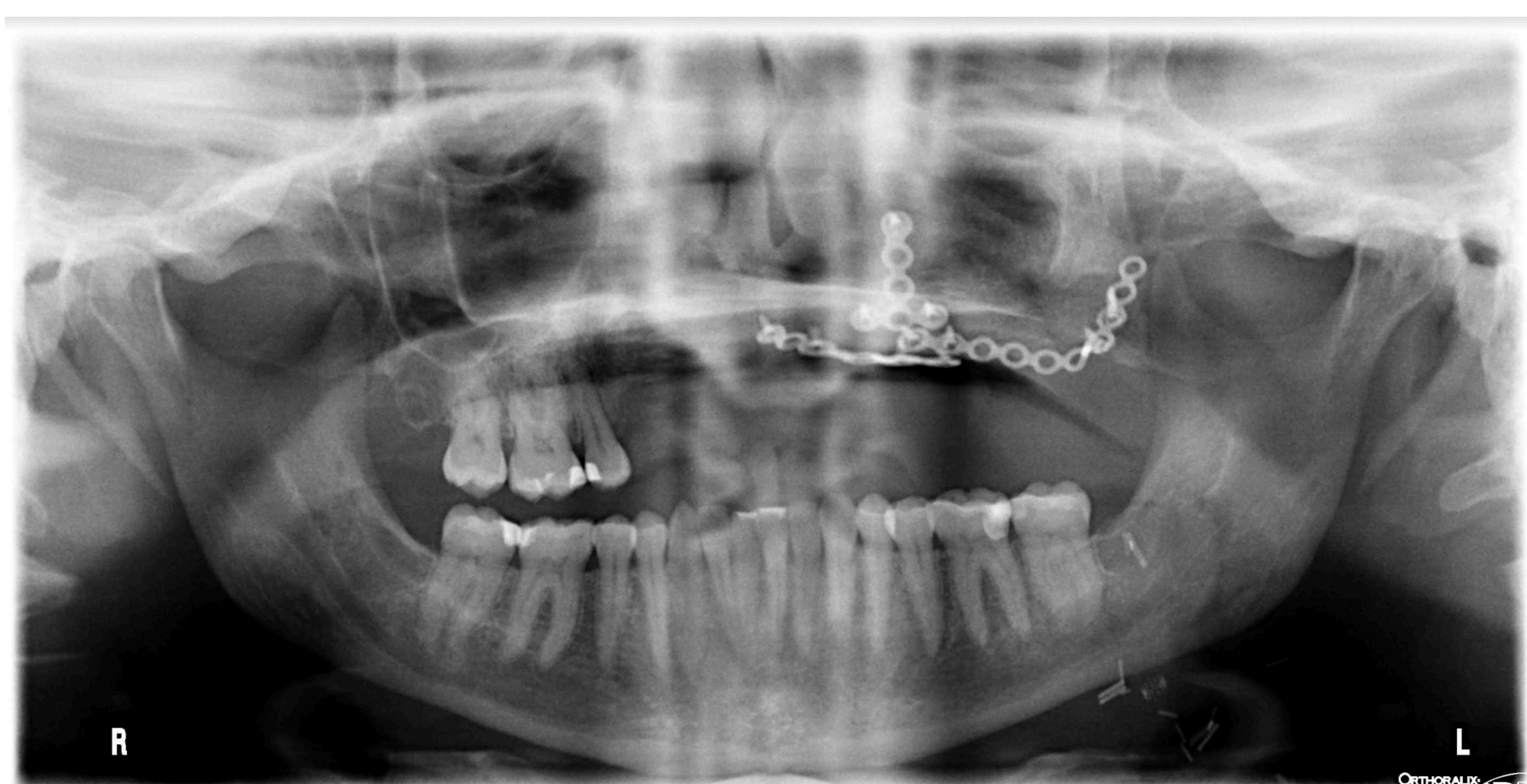
Figure 1: Panorex of a patient who has plate exposure of a segment of a FFF following maxillary reconstruction

There is currently minimal published data regarding the long-term plate-related complications of PSP used with FFF's reconstructing maxillary defects. 3,4