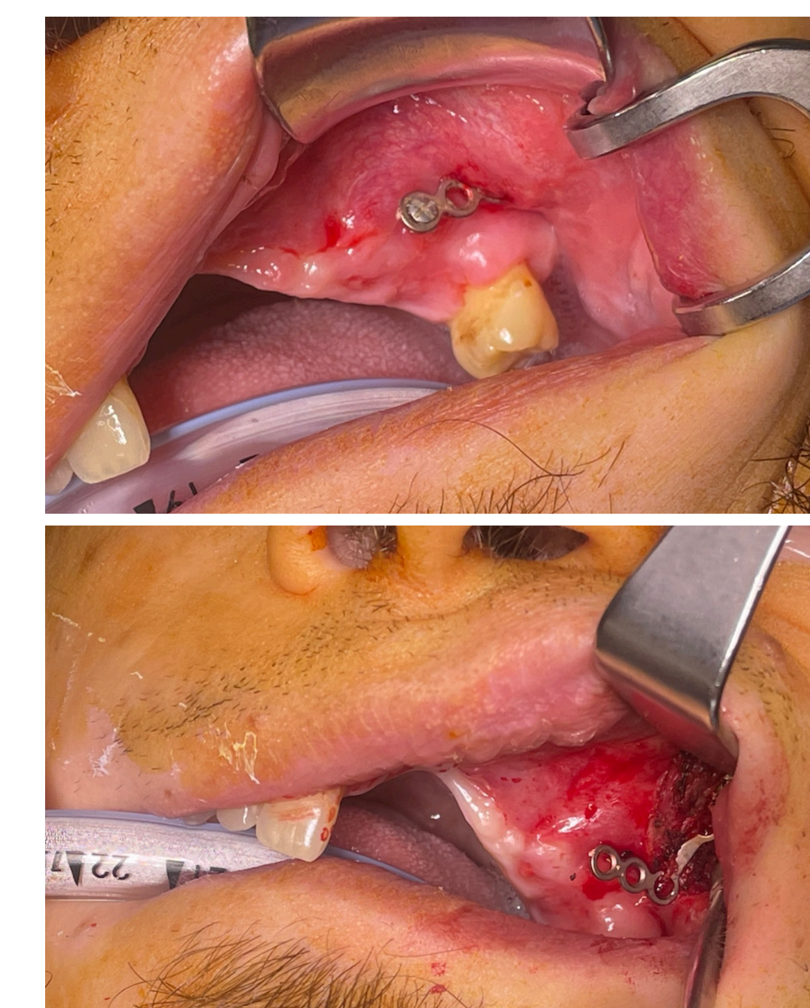
Figures 4 (left, above) and 5 (left, below): Clinical photographs demonstrating intraoral plate exposure in a patient who underwent FFF reconstruction of a maxillary defect during a return trip to the operating room for plate removal

Table 2 demonstrates the surgical and plate-related complications in these patients.