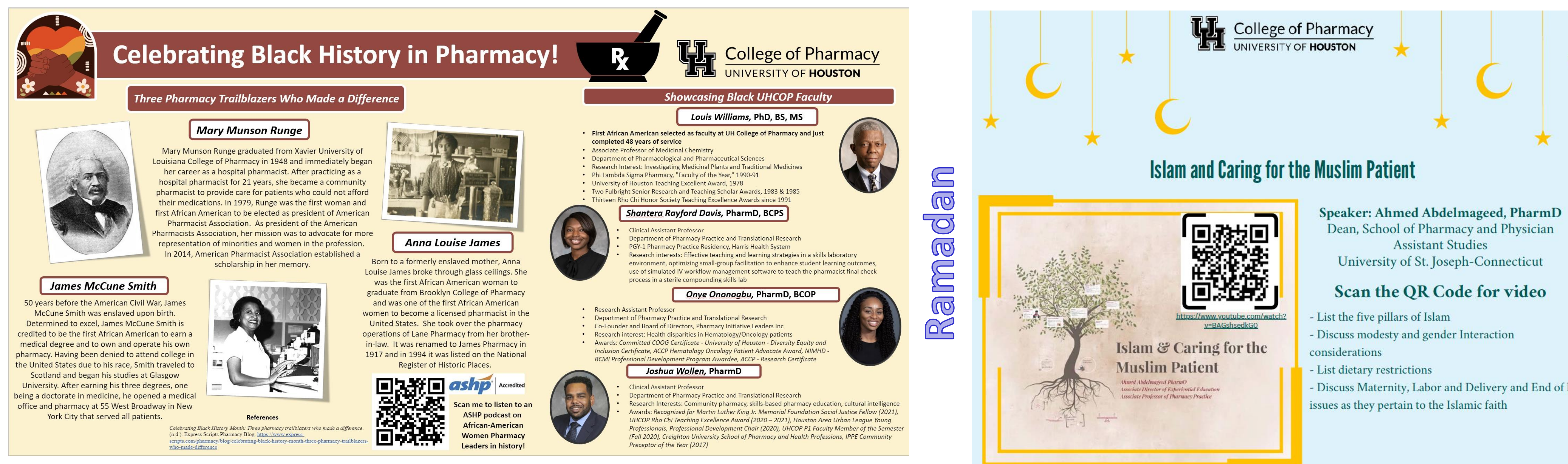
Figure 1. Cultural celebrations highlighted by Student Services