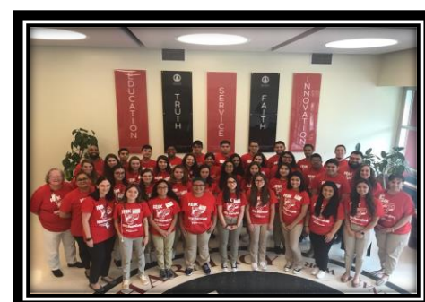
PharmCamp 2022 Participants