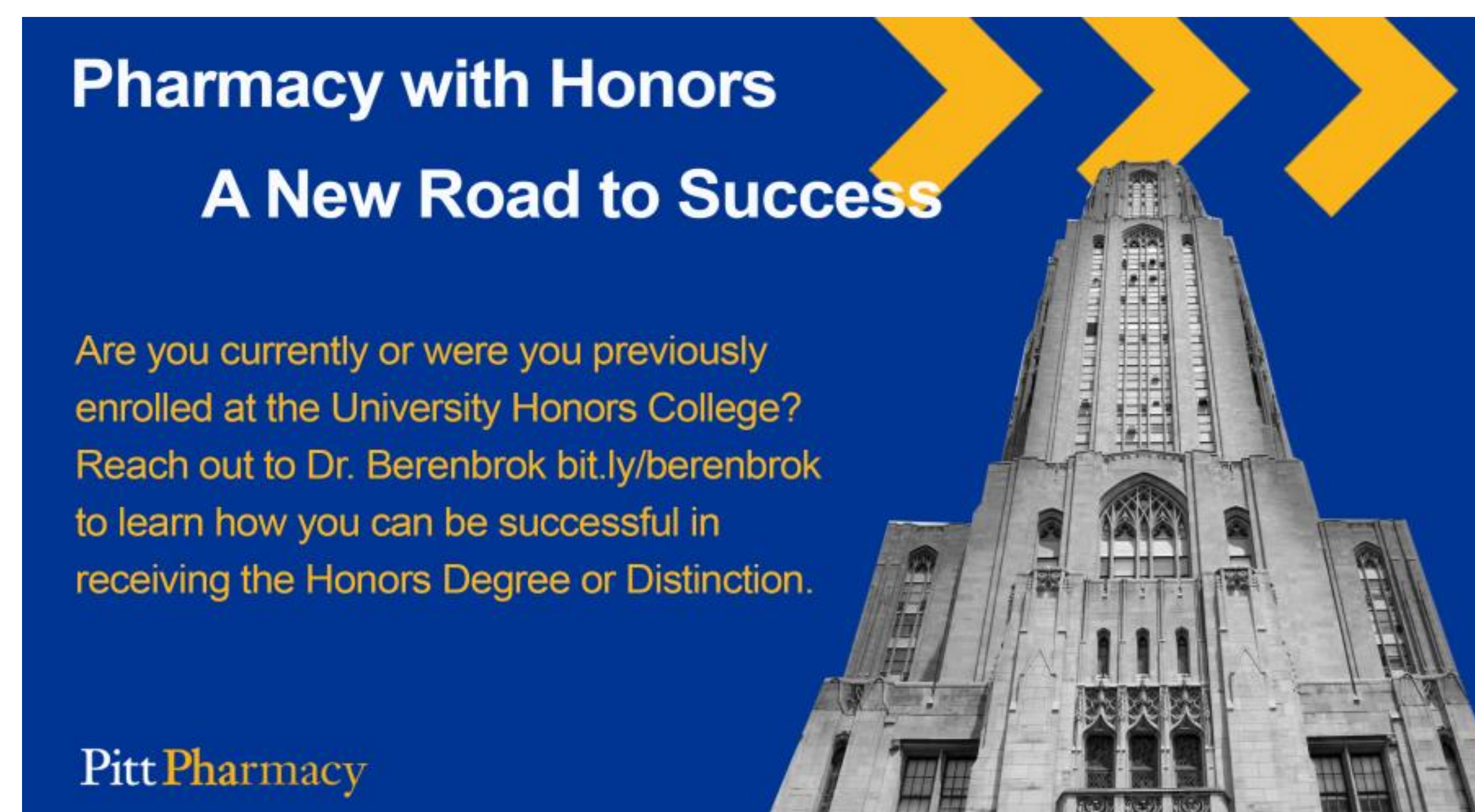
Figure 1. Visual used to encourage student pharmacists to pursue honors.