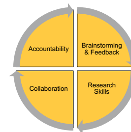
Figure 2. Benefits of a SoTLA Community