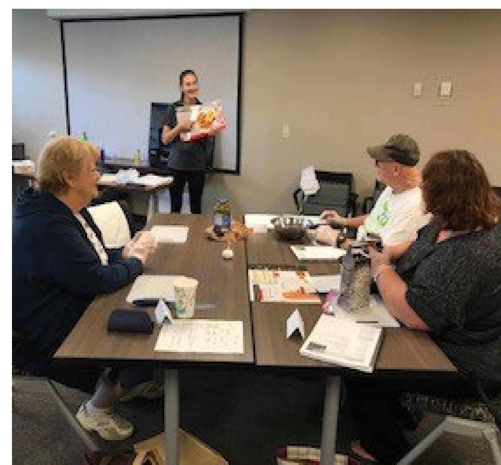
Diabetes-Friendly Cooking Demonstration