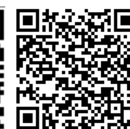
OSUWMC Diabetes Self-Management Education and Support Program