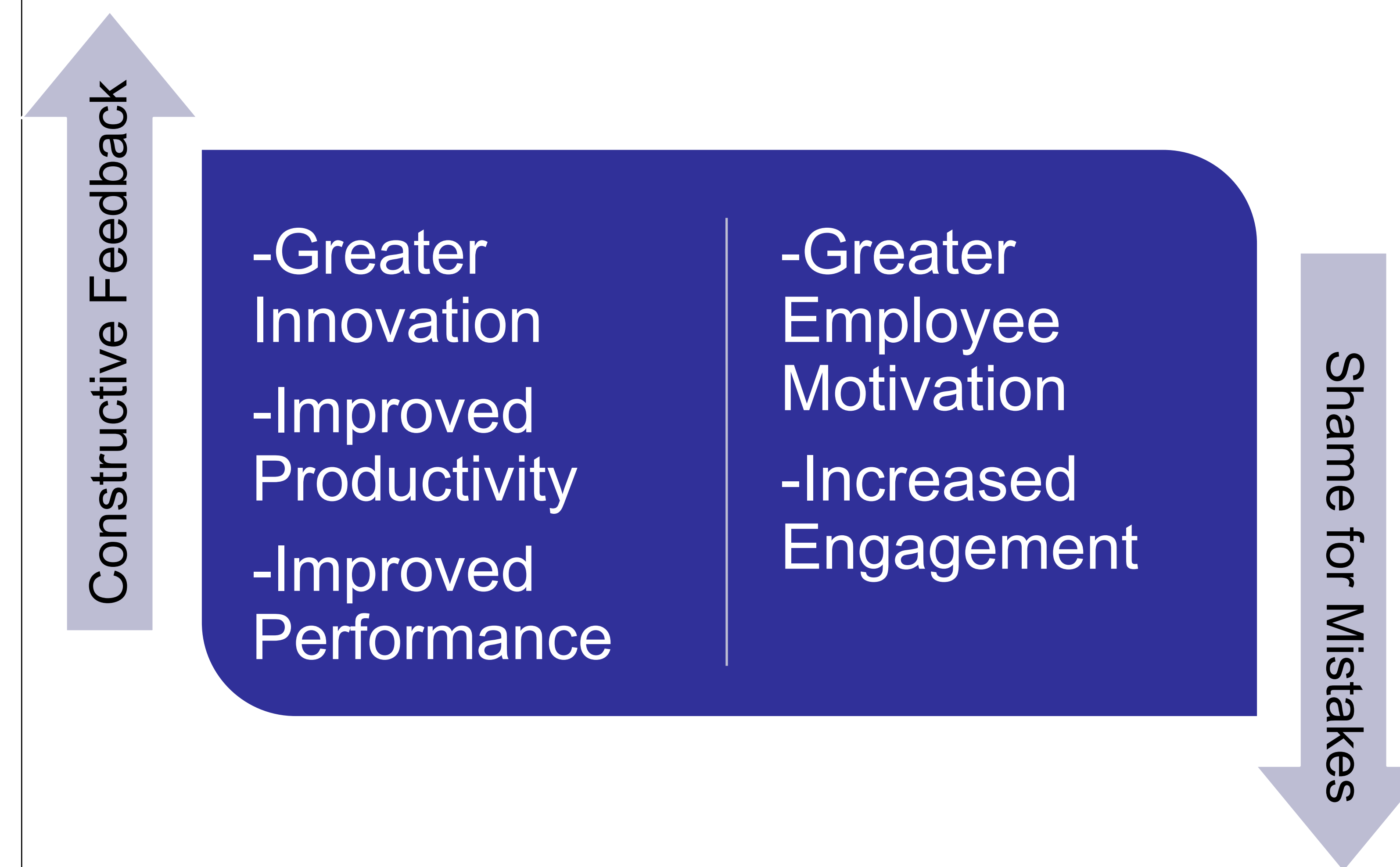
Fig 2. How Coaching Affects Performance