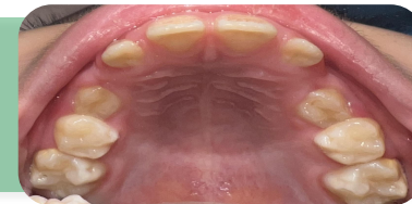
Intraoral photos showing ankylosis of first primary molars.

The influence that parents have on their children is fundamental and may or may not favor dental behavior. The aim of this case report is to demonstrate the role of a mother that was crucial for the success of treatment in a patient with a disability.