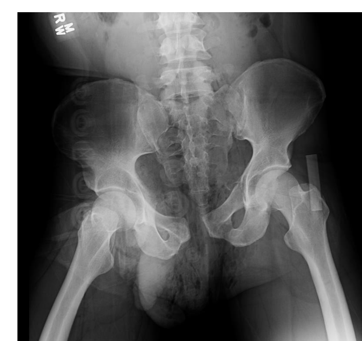
Figures 2 and 3. Portable pelvis x-rays obtained in the trauma bay. Open book pelvic fracture with open component. 7 cm diastasis of pubic symphysis. Fracture of left sacral ala. Diastasis improved to 2.2 cm in figure on the right.