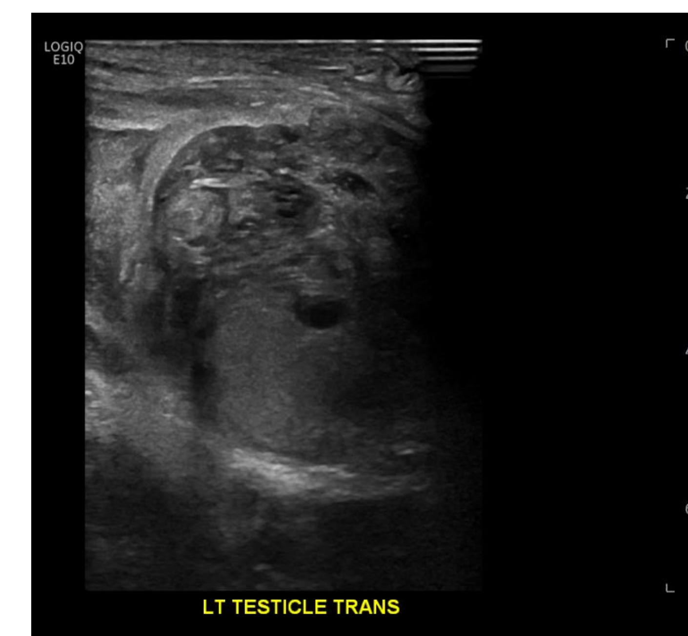
Figures 4 and 5. Testicular Ultrasound. The right testicle measures 2.7 x 3.2 x 4.5 cm, with normal margination and echogenicity. The left testicle measures 2.5 x 2.3 x 2.5 cm, with irregular poorly delineated margination and a large region of heterogeneous echogenicity adjacently which is suspicious for extruded testicular tissue, possibly related to rupture.